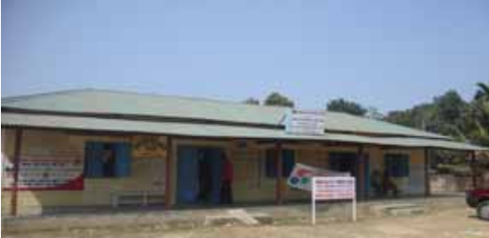
Dukli Health Care Centre