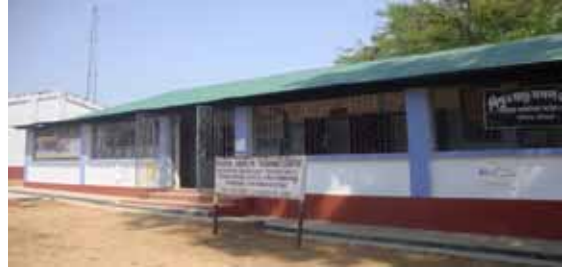
Madhupur Health Care Centre

Students are posted for the community field experience at two centres one is urban community health centres and the other in Rural community health centre . Besides these two centres students also gain field experience through observational visits based on needs their curriculum. Students also conduct various health camp, based on needs of the community.